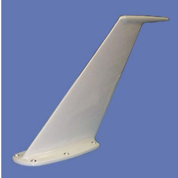
US Patent No. 4,509,053